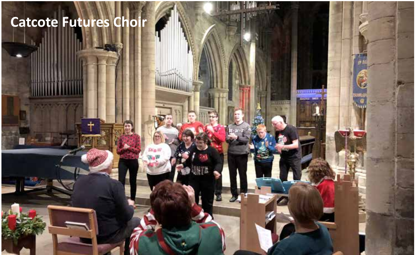
Catcote Futures Choir

In November a new choir was formed at Catcote Futures. Students from across the college put themselves forward to be part of the group. Over the last half term the students have worked exceptionally hard to learn the lyrics, musical arrangements and sign actions to five different songs. Since half term the students have had three live community performances. The Annual Award Ceremony for Catcote Futures, St Hilda's Church (switching on the Christmas tree lights) and at The Vestry with the Hartlepool Community Choir.