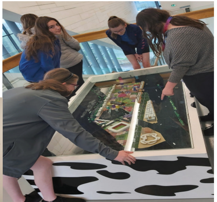
Class 13's - East Durham College

Students were excited with the Careers Challenge week from Altrad, researching and designing a car from recycled items. Class 8 and Class 13 were all involved deciding which car to make and working well as a team. Class 8 made a PowerPoint to explain their experience.