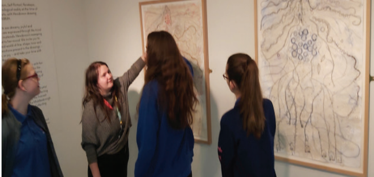
Chitty Chitty Bin Bin

Creative Arts students visited the MIMA art gallery to explore a range of contemporary artists that showcase worldwide and around the Tees Valley area. They enjoyed walking around, speaking to curators and learning about the history of the building.